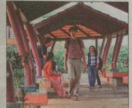
The move may help IIM students get global acceptance for their qualification FILE PHOTO