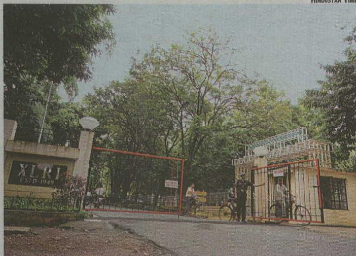
Autonomy issue: XLRI Jamshedpur's Xavier Aptitude Test (XAT) is one of the top five admission tests for management schools.

"It's a huge relief as the business schools are on the